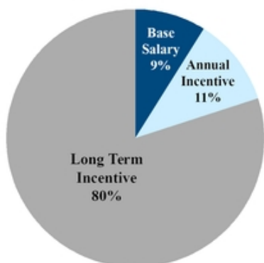
CEO Target Compensation Mix