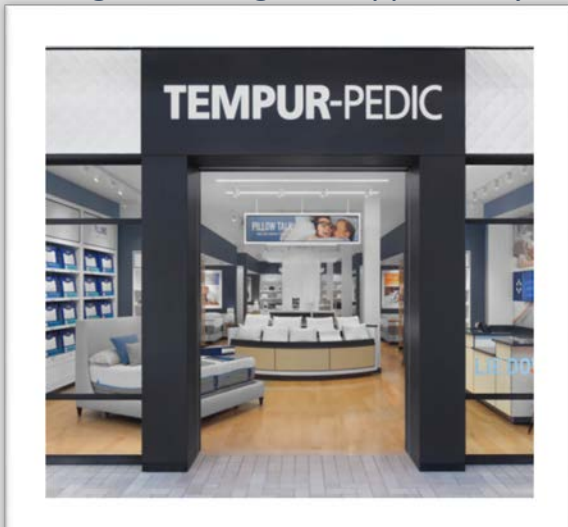
High-End Targeted Opportunity